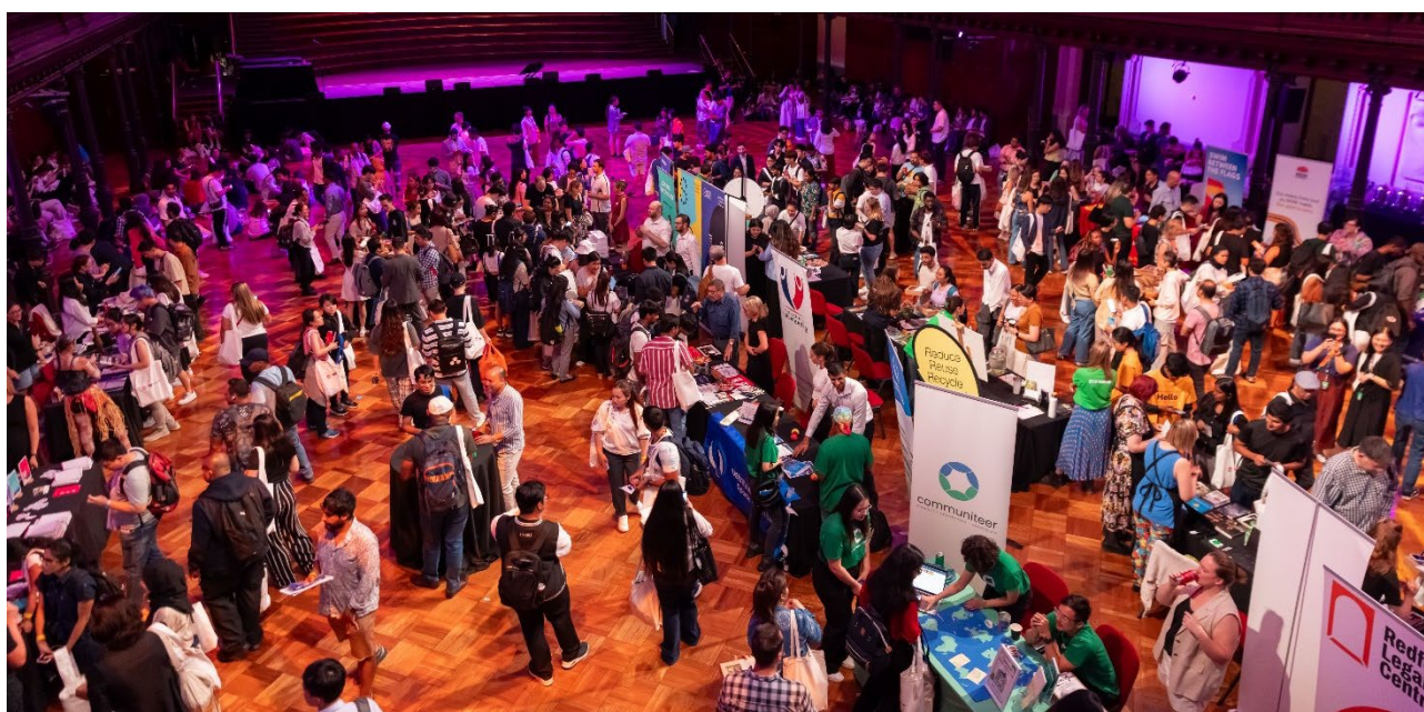
Image 16. Lord Mayor's Welcome for international students, Sydney Town Hall, March 2024.

Of the $1,594,000 total corporate sponsorship revenue received, $142,000 was made up of cash and 1,452,000 was value in kind.