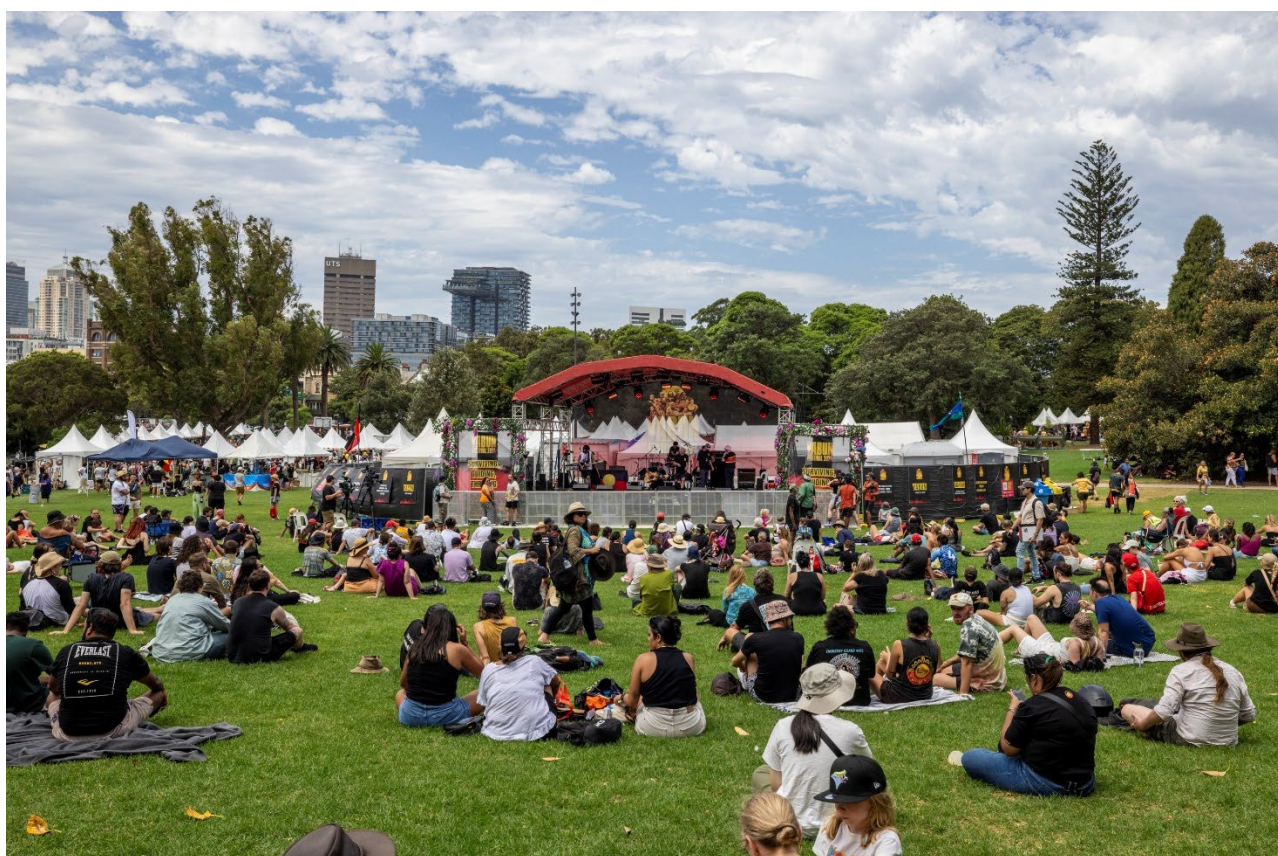
Image 5. Yabun festival, Victoria Park, Camperdown, January 2024.