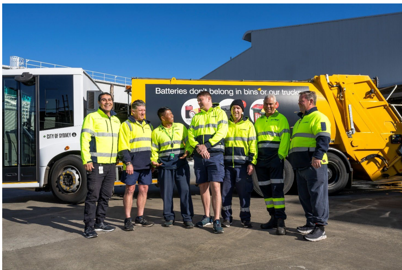
Image 8. City of Sydney cleansing and resource recovery staff members.

The City was awarded the NSW Local Government Award for Diversity and Inclusion, and the NSW UDIA and MYBOS Diversity and Inclusion Award for Excellence.