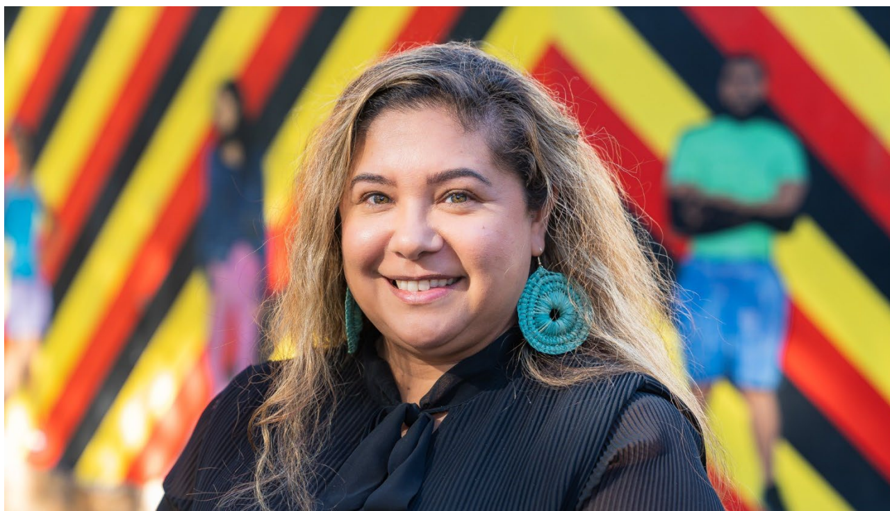
Image 7. The City of Sydney’s Workforce Advisor – Aboriginal & Torres Strait Islander Inclusion.

The City developed employment initiatives that provide opportunities for Aboriginal and Torres Strait Islander candidates, young people with disability and refugees/asylum seekers who face barriers to employment.