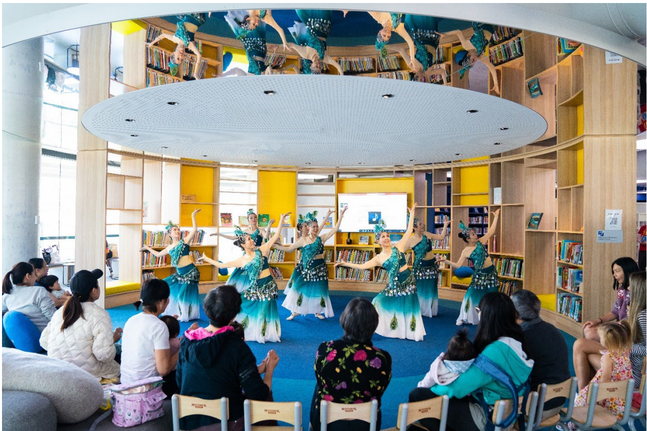
Image 2. Rhymetime at Darling Square Library.

The City has no activities funded by special rate variations income.