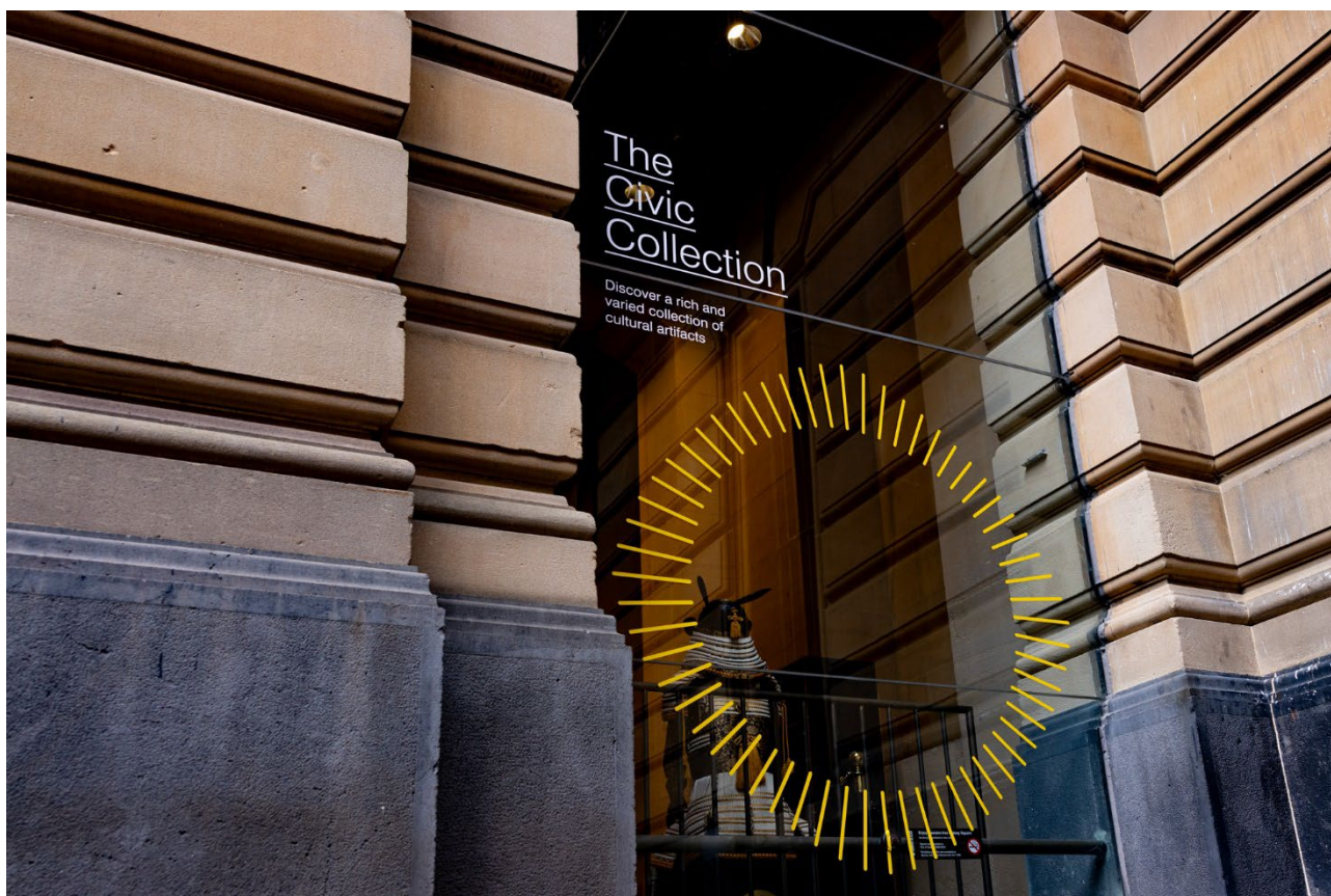
Image 15. The Civic collection exhibition at Town Hall House. This collection of items documents our civic history, celebrates major events, respects cultural diversity and reflects on the changing nature of Sydney and its people.